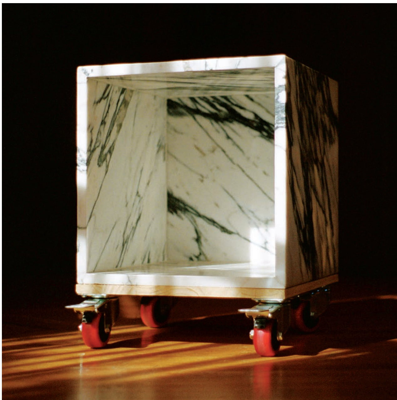
“Marble Cube Table” (2016) and “TeePee Home” (2016).

I could go on and on about why I think this place is important, but, yeah. It’s one of my favorite places in the city.