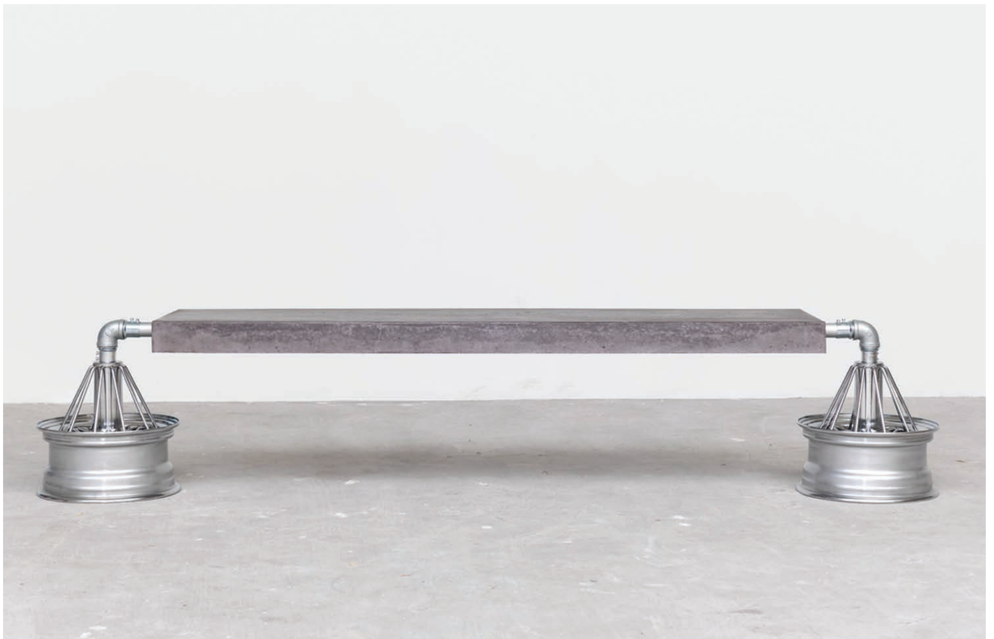
“Bench on 84’s” (2017). Courtesy Dozie Kanu

That ended up being a very pivotal moment in my life where I was just ... alright, I gotta get out of Texas. I met a lot of people that I ended up linking up with when I finally