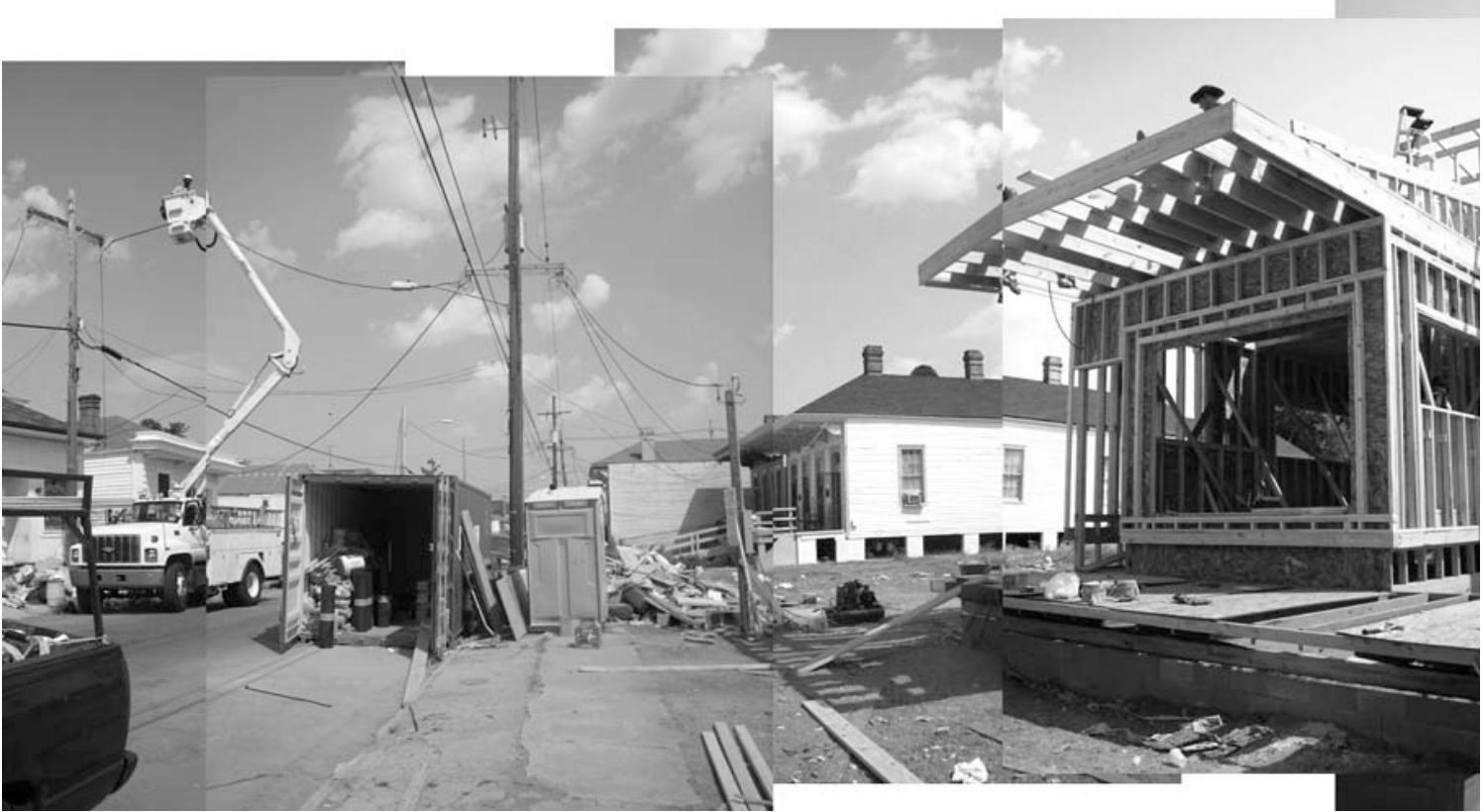
URBANbuild allows Tulane University students to design and construct affordable housing for damaged New Orleans neighborhoods.