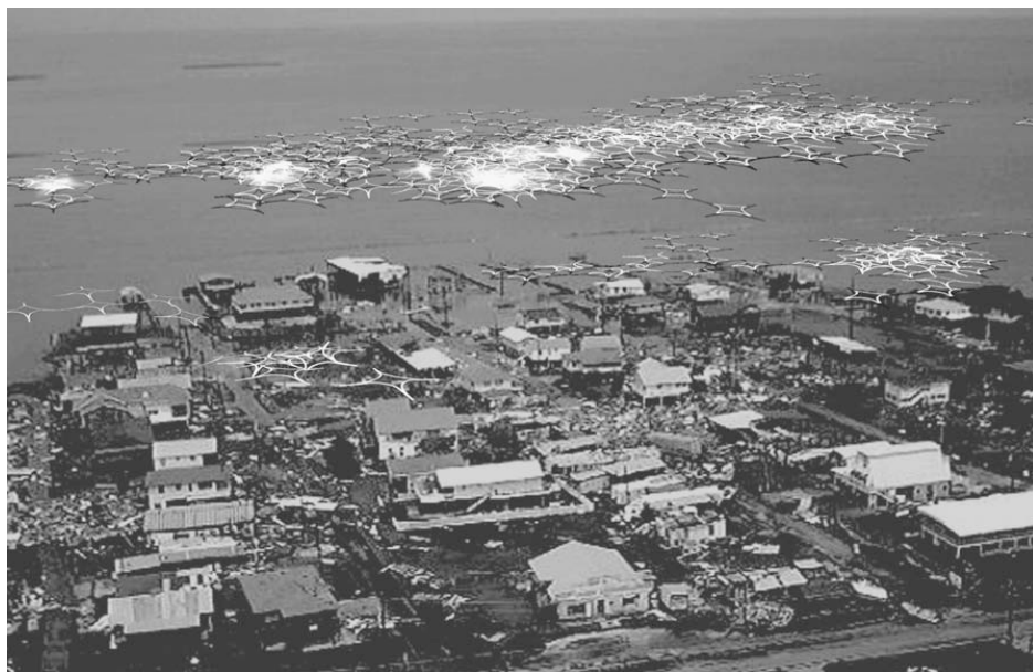
A fiberglass net constellation collects wave energy and stores it for later use.

Using Grand Isle, Louisiana, as a case study, Newell sought to return something to the community following its losses in Katrina. Her version of sustainability envisions a net made up of fiberglass segments that lies on the waves just beyond the shore. During storms, the net capitalizes on shifting water levels and intense wave action to collect energy via magnetic induction, storing and then later distributing electricity when it's needed. Fiberglass was the material selected because it's lightweight for easy transport, resistant to damage, and familiar to local boaters. Newell is currently seeking a backer to extend her research.