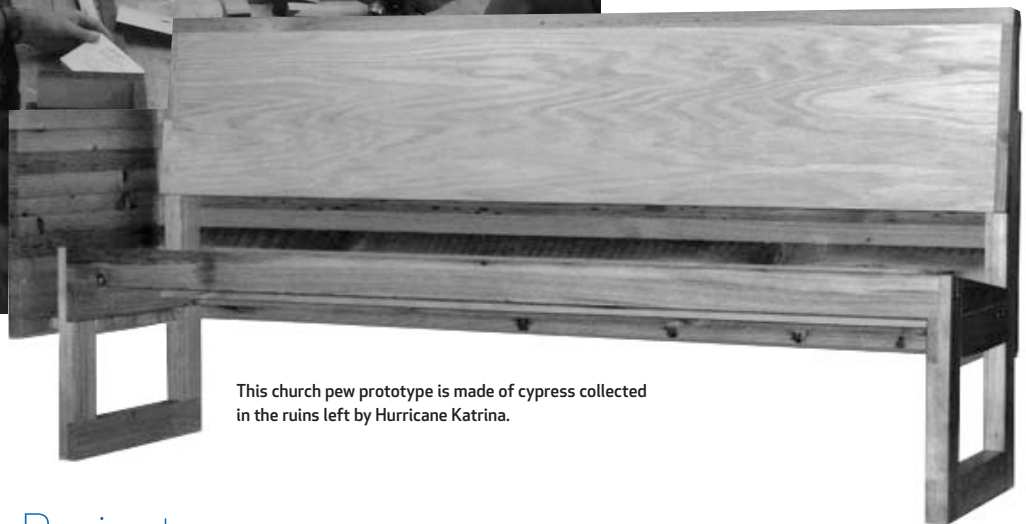
This church pew prototype is made of cypress collected in the ruins left by Hurricane Katrina.